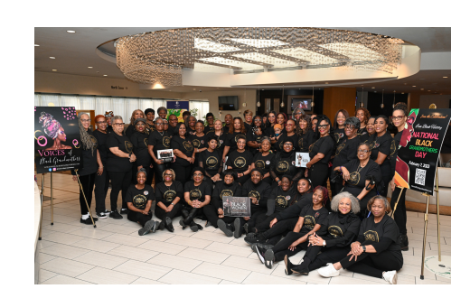
and Annual Conference and Gala Chicago, IL